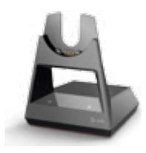
Voyager Office base (available as an accessory, sold separately)